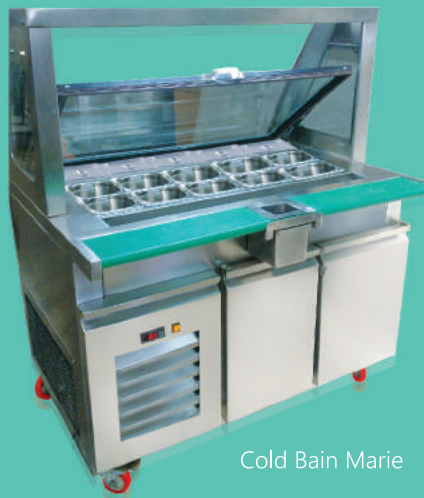
Cold Bain Marie