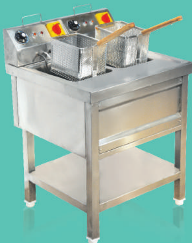
Deep Fat Fryer