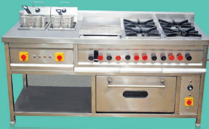
Combined Hot Station

We pride ourselves in the quality of our products, our competitive pricing and our exceptional customer service. We believe that quality comes as a Standard. With our expertise and years of experience in the food service industry, we assure Avant Grade services to all our clients. Our range of services include consulting, kitchen planning & design, project management, installation and dependable after sales service. We are a one-stop shop for a complete service to actualize a preliminary concept to a functional kitchen.