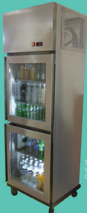
Two Door Vertical Bottle Cooler