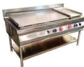
Chappati Plate Cum Puffer