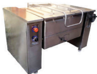
Tilting Braising Pan