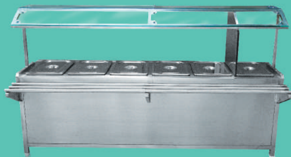
Hot Bain Marie