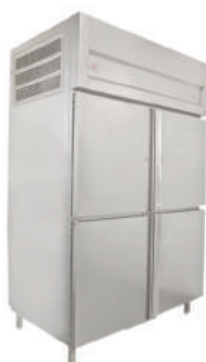
Four Door vertical Refrigerator/ Freezer