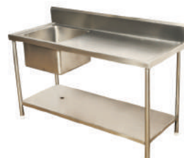
Work Table with Sink