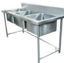
3 Sink Unit