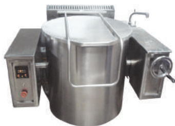
Tilting Boiling Pan