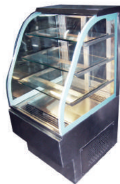
Refrigerated Bend Glass Display counter