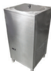
Refrigerated Kheer/Chass Counter