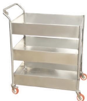
Kitchen Utility Trolley