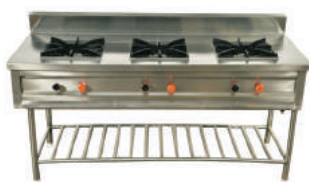
3 Burner Indian Cooking Range