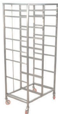
Veg Rack Trolley