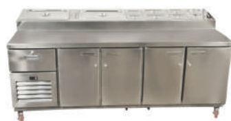
Refrigerated Sandwich Counter