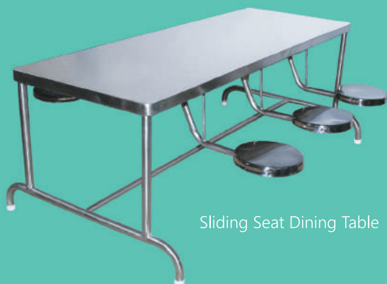
Sliding Seat Dining Table