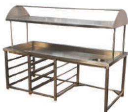
Soiled Dish Landing Table