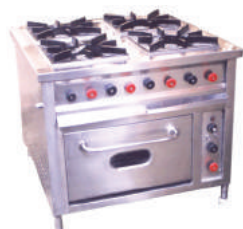
4 Burner Continental Range with Oven