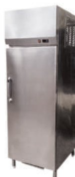
Single Door vertical Refrigerator/ Freezer