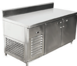
Work top Refrigerator