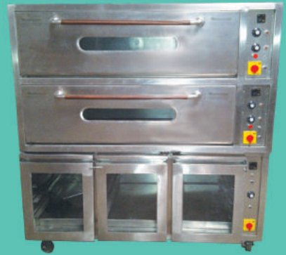
2 Deck Oven With Proofer

Made of 16 SWG 304 grade Stainless Steel duly 120 grit matt polished with all resulting edges rounded with no bur or excess material left. Top will be turned down 2" and ½" underneath in channel shape on all exposed sides, in case of sunk in tops wherever mentioned the sides shall be raised by ¾" on all exposed sides, where tables are placed against building walls, they will be turned up at back approximately 6" returned 3/4:" at 45 degree to wall with all exposed ends closed, argon arc welded and smooth polish.